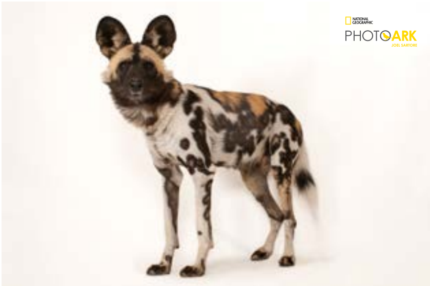
An endangered African wild dog, Lycaon pictus , at Omaha's Henry Doorly Zoo and Aquarium.