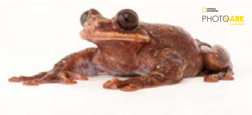
A Rabbs' fringe-limbed tree frogs, Ecnomiohyla rabborum , at the Atlanta Botanical Gardens.