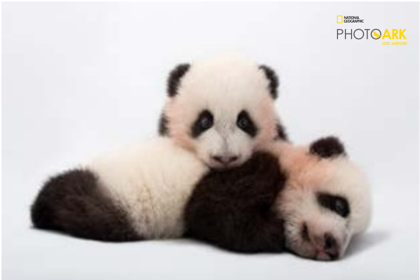
Mei Lun and Mei Huan, twin giant panda cubs, Ailuropoda melanoleuca , at Zoo Atlanta.