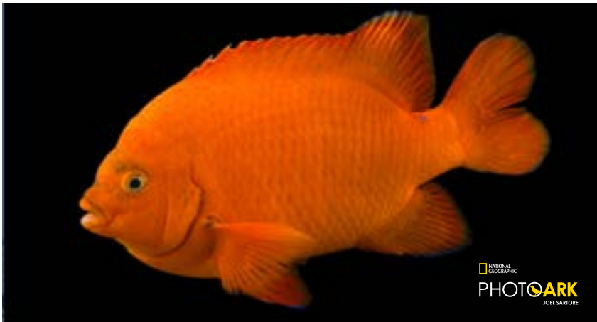
A garibaldi fish, Hypsypops rubicunda , at the Research Experience and Education Facility, at the University of California, Santa Barbara.