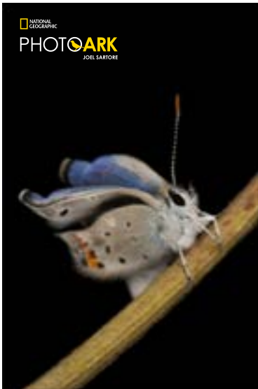
A rare Karner blue butterfly, Lycaeides melissa samuelis , at Toledo Zoo.