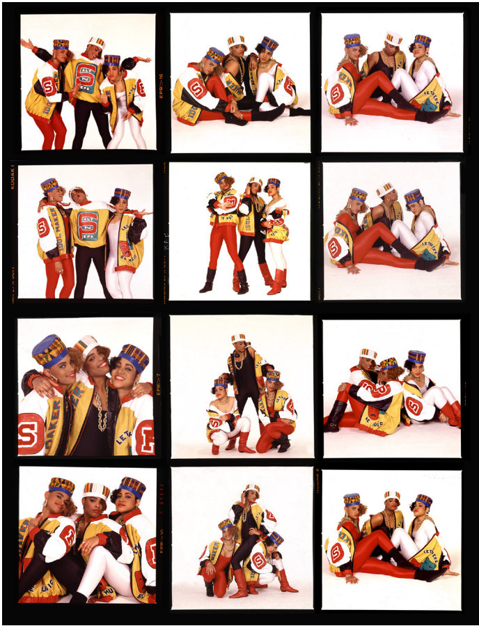
Salt-N-Pepa (NYC, 1987).