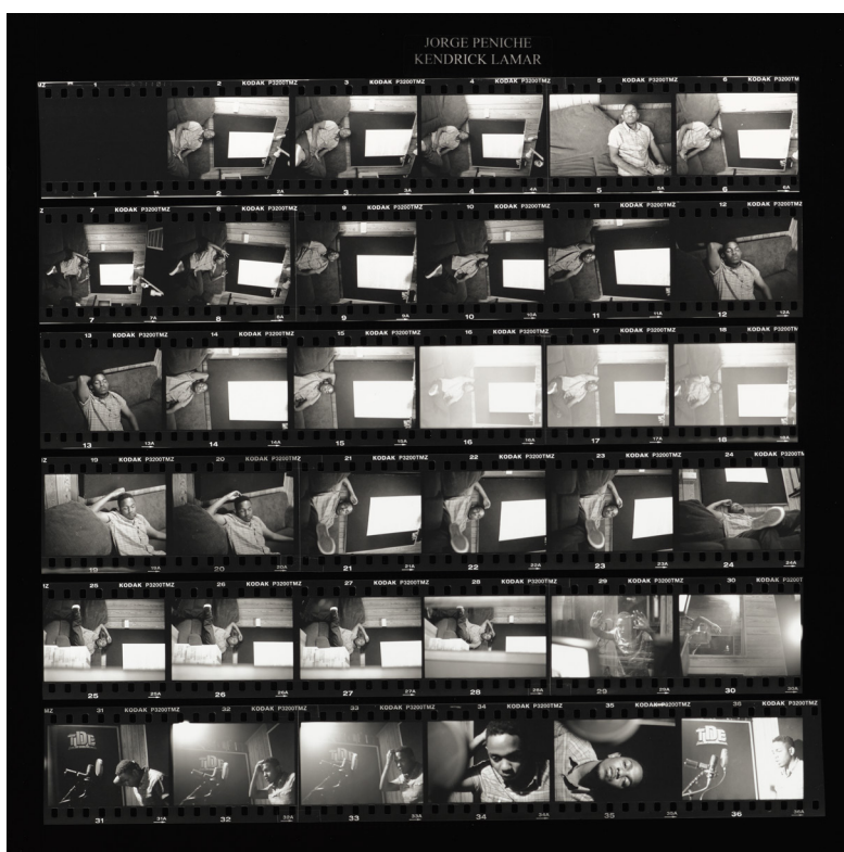
Kendrick Lamar (Los Angeles, 2007)