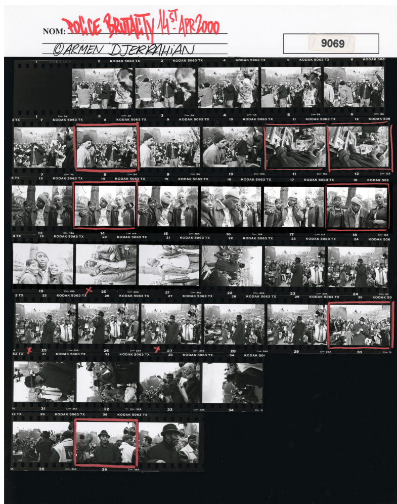
Mos Def (NYC, 2000)