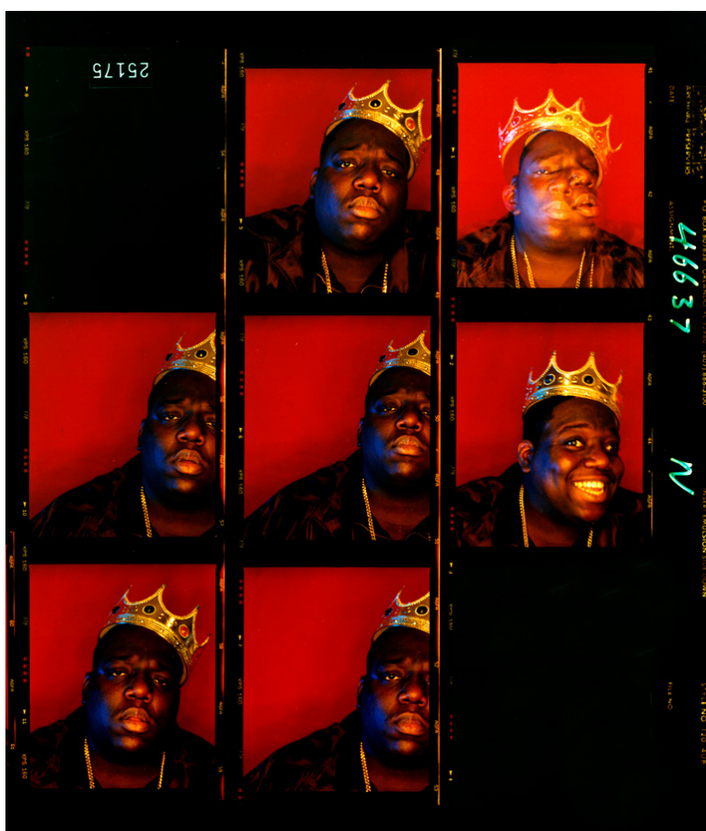
"The King of New York" (Notorious B.I.G., NYC, 1997)

"For this shoot, I told Big's team that I wasn't interested in photographing him if he was just gonna show up wearing sweatpants. At the time, hip-hop images were pretty stereotypical for the most part. I have no interest in negative portrayals of black people or showing people at their worst. Even if it was real, that shit bores me. Most black people are just living their lives, and most of the hip-hop imagery showed people in Jacuzzis, imagery made for teenage boys—but not this one. This photo is about hip-hop but it's also beyond that. This was simply about photographing Biggie as the King of New York. He is depicted as an almost saint-like figure." (Excerpt from Barron Claiborne interview, from CONTACT HIGH )