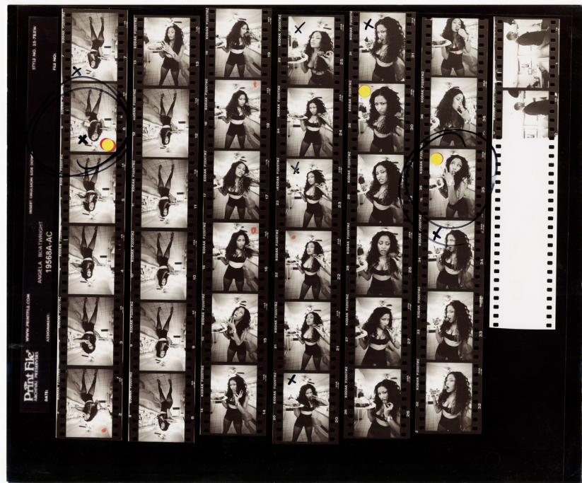
Nicki Minaj (Queens, 2008) by Angela Boatwright.